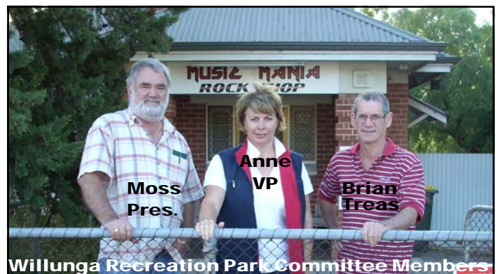
Willunga Recreation Park Committee Members