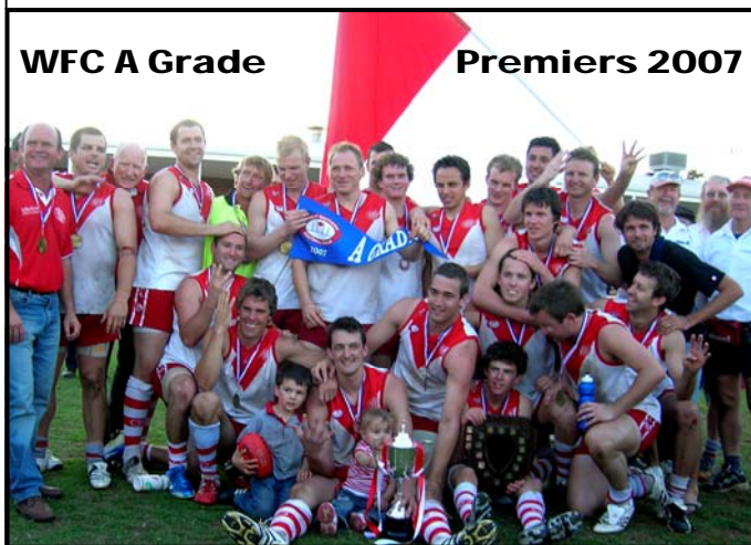
WFC A Grade

Over the past ten years the Willunga Football Club has worked tirelessly to develop well