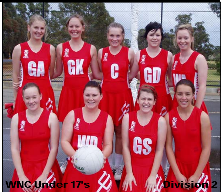
WNC Under 17's Division 2

During the year there will be several events that will enable sponsors to receive recognition of monies paid and/or donations of goods for raffle prizes, catering events etc.