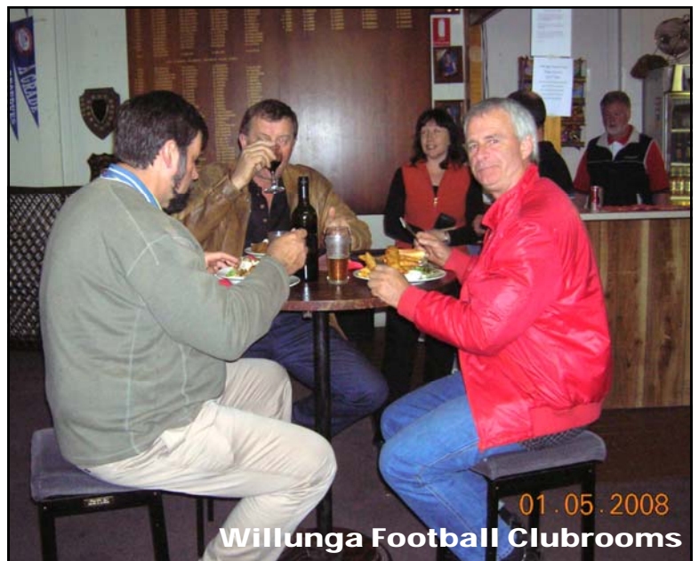
Willunga Football Clubrooms

Please come and join us for a great season of football in Willunga!!