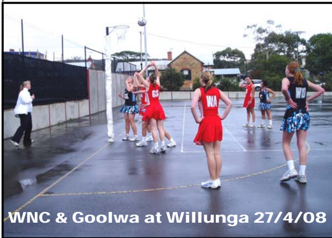
WNC & Goolwa at Willunga 27/4/08

Established in 1934, Willunga Netball Club has been (and still is) one of the most successful Clubs in the Hills Netball Association and more recently in the Southern Hills Netball Association (SHNA).