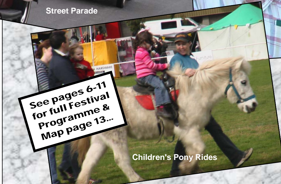
Children's Pony Rides